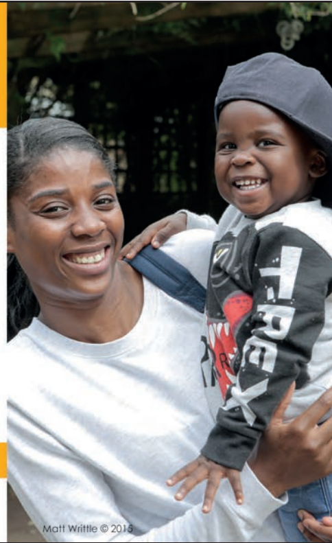
Matt Whittle © 2015